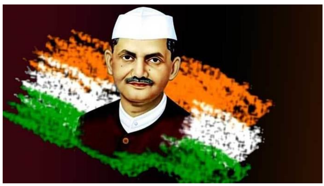
VP Institute of Management Studies & Reserach, Sangli Harmony Day